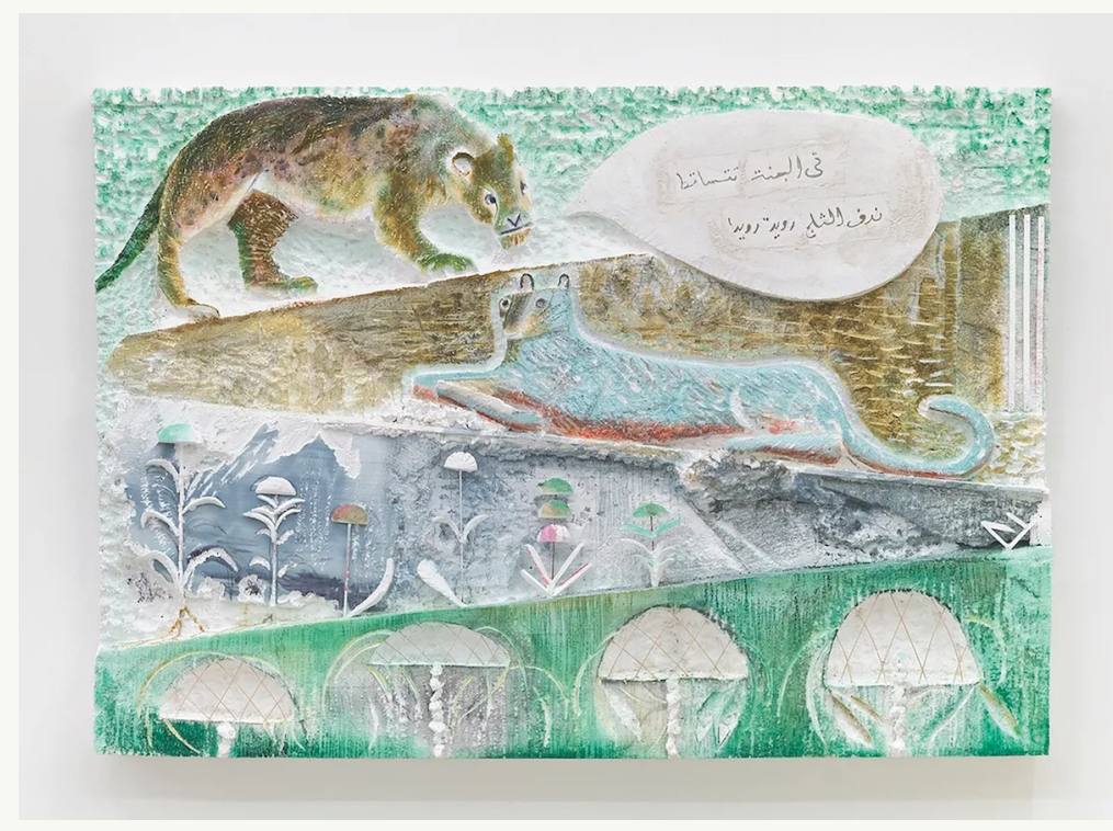
Lin May Saeed: Mureen/Lion School, 2016.

fabric as their material; they're like fragments of a Faraday cage. The whole, titled I Think My Cells Are Fucking Behind My Back , points to attritional attempts to ward off a world full of invasive forces that bypass rationality or control.