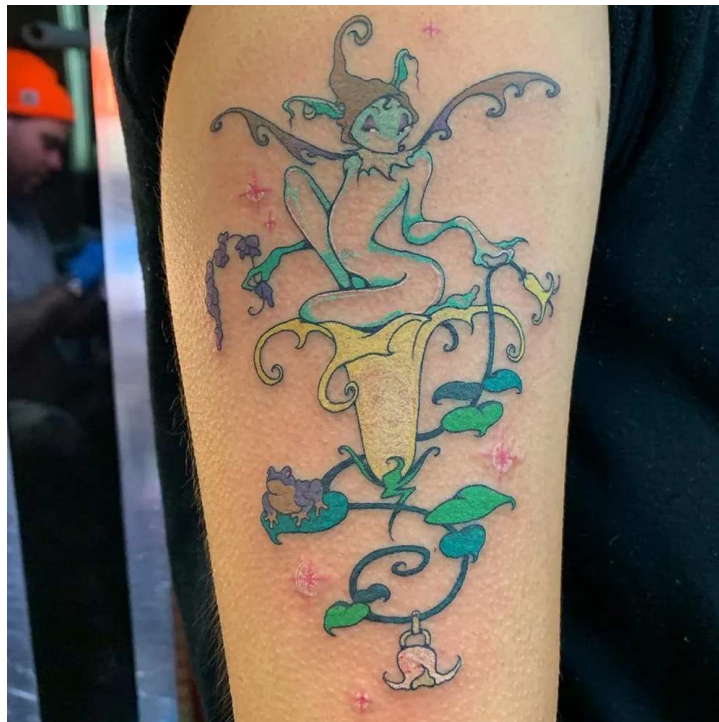
Tattoo by Will Sheldon.

To make the paintings in this show, I combined airbrushing and hand painting. I do both techniques using Golden acrylics—I water down the paints to airbrush them. Sometimes, I start with a black canvas; other times I build up to the black with layers of dark washes. Then I’ll go in with a black airbrush and make a sketch of the landscape or scene. I build up the painting from there, working my way to the more detailed layers on top, which I create using a brush. Sometimes, the idea comes from a sketch I did beforehand, but usually, I’m just drawing straight onto the canvas, creating the image right then and there.